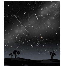
The Night Sky

Adelaide is THE MOST LIVEABLE city in Australia, Minister it is not too late to work with us to keep it that way.